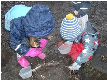
Looking for bugs in the mud!

It's about being allowed to be a child and having FUN in the outdoors!