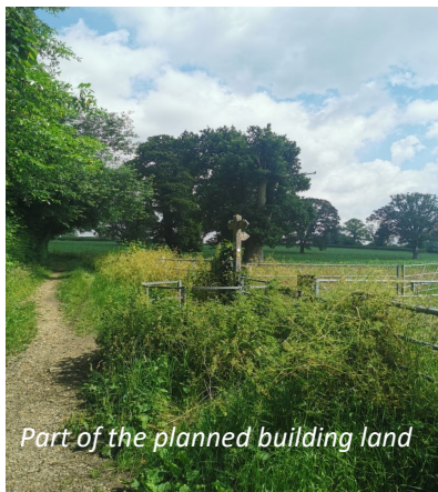
Part of the planned building land

The Stinsford proposal, which the county council refers to as Dor 13, represents about ten per cent of all planned housebuilding across the county. In total, the County Plan, which was the subject of a public consultation exercise earlier this year, identifies possible locations for up to 30,000 houses plus a further 9000 in case of possible spill-over from Bournemouth and Poole.