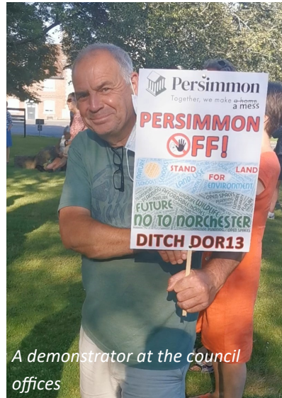
A demonstrator at the council offices

there’ll be further opportunities to comment when the plan is submitted to the Secretary of State for examination in public late next year or in 2023.