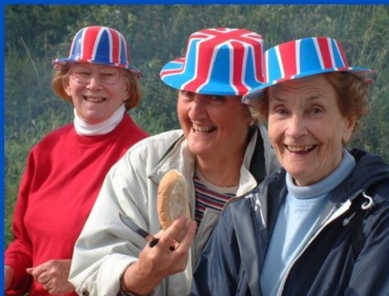
Three well known Charminster faces from the Queen's 2002 Golden Jubilee party held at the golf course in Charminster

A: Yes, there will be an apple day in the Charlton Down orchard again this year, after missing last year due to Covid restrictions. This year it will be on Sunday 3rd October between 10am and 4pm . Do come along and take part in the pressing of apples into fresh juice. Make sure you bring containers to take some juice home with you! There should be plenty of apples in the orchard but you can always bring some from your own garden if you wish. It is always a fun event so don't miss it.