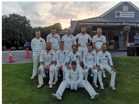
A successful side ready to celebrate