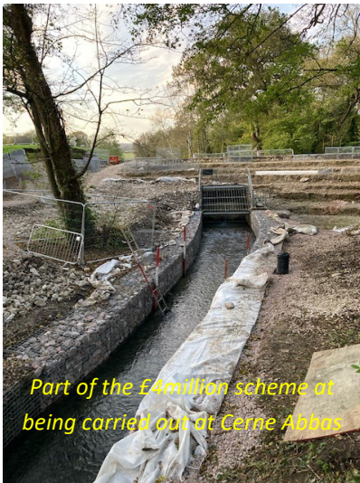
Part of the £4million scheme at Cerne Abbas

2019/05/13 how-check-clean-dry-can-help-protect-our-freshwater-environment-and-animals)