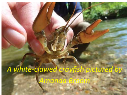
A white-clawed crayfish

threat from phosphorus and other fertilisers which are washed off agricultural land. The crowfoot provides food and shelter for invertebrates including the increasingly rare, White-clawed crayfish. This is the only native crayfish found in British rivers.