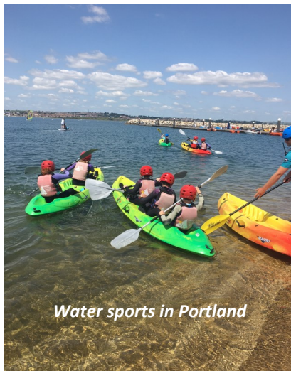
Water sports in Portland

The Beavers spent a day with Puddletown Beavers at Brown Johns Copse Crossways and the Cubs and Scouts a weekend at PGL with Puddletown Cubs and Scouts, They all had a great time and made new friends. It was lovely to see our young people out enjoying themselves once again.