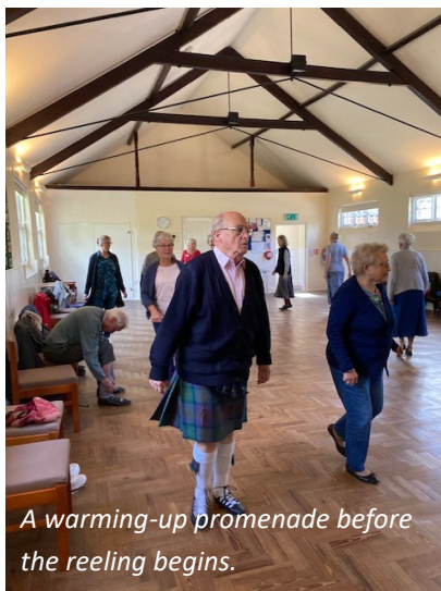
A warming-up promenade before the reeling begins.