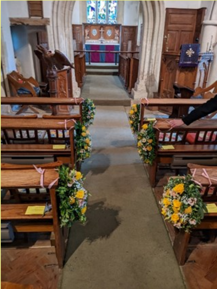
Water sports in Portland