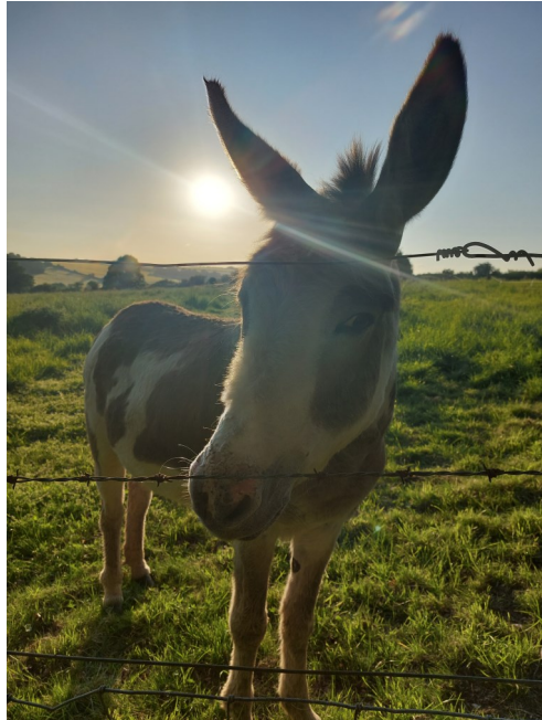
A donkey at sunset in Charlton Down.